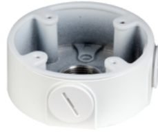
PFA137 Junction Box