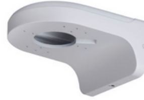
PFA203W Wall Mount Bracket