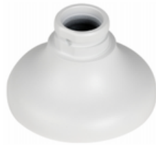
PFA106 Mount Adapter